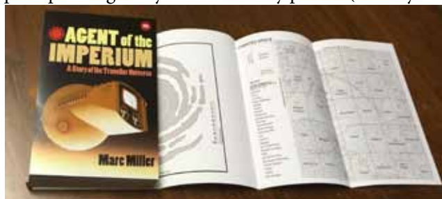
Includes back-of-the-book foldout Map of the Imperium, List of Emperors, and the Imperial Calendar.

If you know the Traveller science-fiction role-playing game, then some of this is already familiar; if not, no matter; this story is set in the Traveller universe, but requires no game-playing knowledge or experience. But, this story introduces the vast human-dominated interstellar empire of the far future in ways only its original designer and chronicler can.